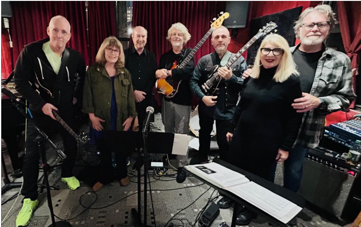
Exposure: open rehearsal, Sept 2024 NYC

The band presents the full Exposure album in the original sequence from the 1979 release, in both electric and acoustic contexts, presenting a comprehensive view of this influential album and its diverse tracks. The original album includes contributions from Tony Levin, Jerry Marotta, Phil Collins, Peter Hammill, Daryl Hall and Peter Gabriel. The band presents a complementary selection of Roches material, much of which was produced by Robert during his New York period.